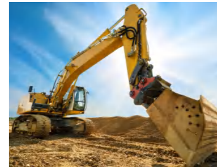
| LEVELING TRENCHES