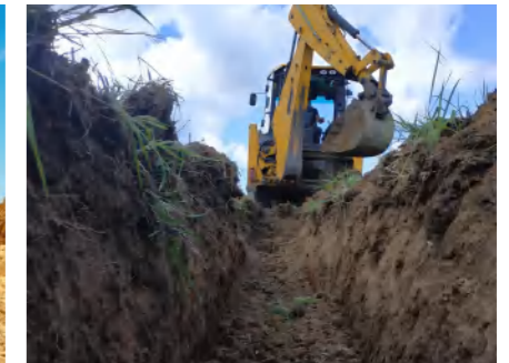
| TRENCH DIGGING