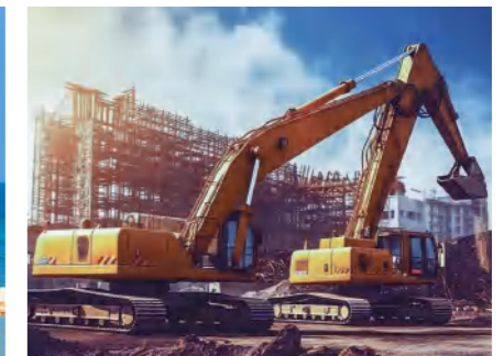
| FOUNDATION EXCAVATION