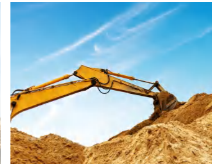
| GRADING SLOPES