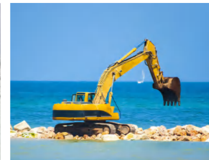
| UNDERWATER OPERATION