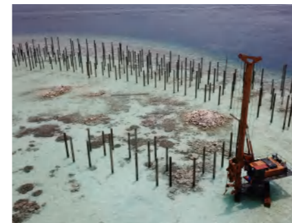
| HIGH-ACCURACY PILING